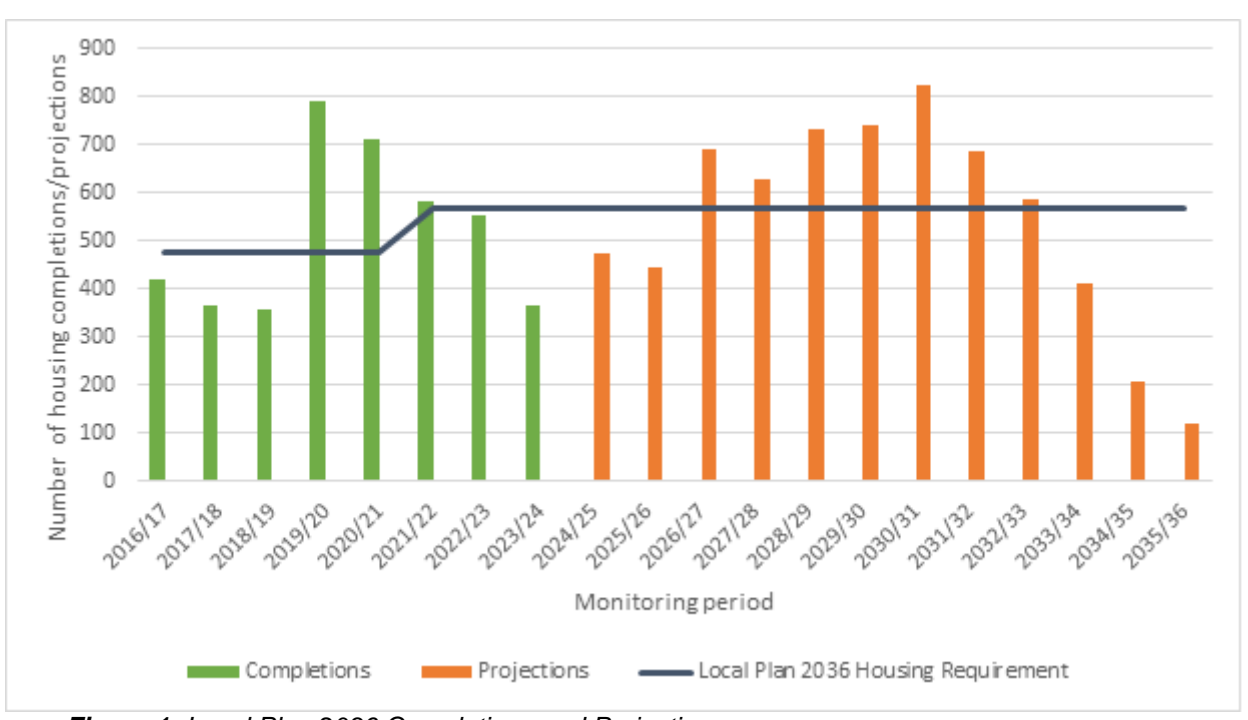
Figure 1: Local Plan 2036 Completions and Projections

14. In this monitoring year 365 (net) dwellings were completed in Oxford of which 61 were affordable dwellings. This includes the equivalent numbers calculated through the application of ratios for communal accommodation (student completions and other communal accommodation). Whilst the number of completions in the 2023/24 monitoring year has fallen below the Local Plan's annual requirement, the cumulative number of dwellings completed in the 7 years since the start of the Local Plan period (2016/17 to 2023/24) is 4,145 dwellings (net). The housing trajectory had projected that by 2023/20243, 4,076 dwellings (net) would have been provided (Figure 1). Figure 2 below shows the cumulative projection is just under the target to meet the minimum of 10,884 dwellings to 2036 as set out in policy H1, and officers are working to maximise opportunities to deliver housing to meet the target.